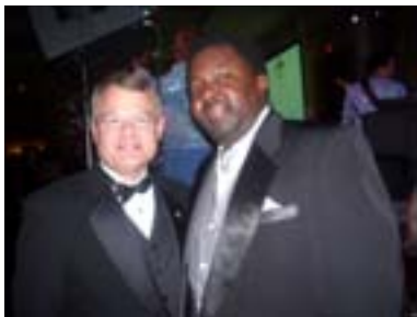
Congressman Mike McIntyre &

The Second Chance Act is federal legislation designed to improve outcomes for people returning to the community from prisons and jails.